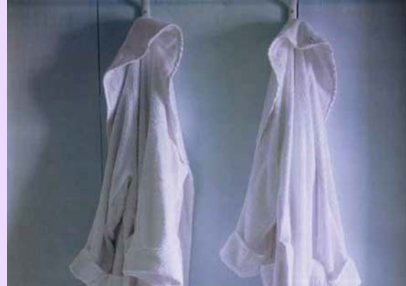
Space was at a premium in the bath. So rather than adding shelves, interior designer Pat Moreinis Dodge installed hooks for robes and towels.

A bathing suite outfitted with a double vanity and a separate tub-and-shower room proves two teenage sisters really can (happily) share a bath.